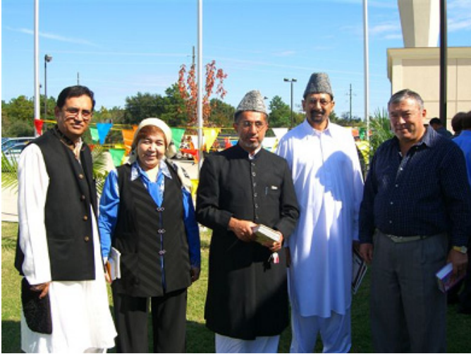
Houston ansar with guests on Eid-ul-Fitr