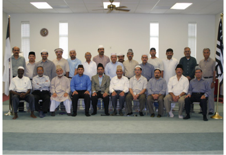
Group photo of Dallas ansar