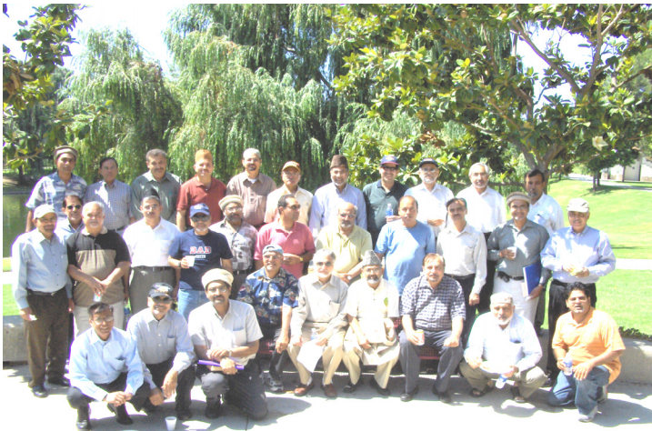
Annual Picnic of Majlis Ansarullah L.A. East